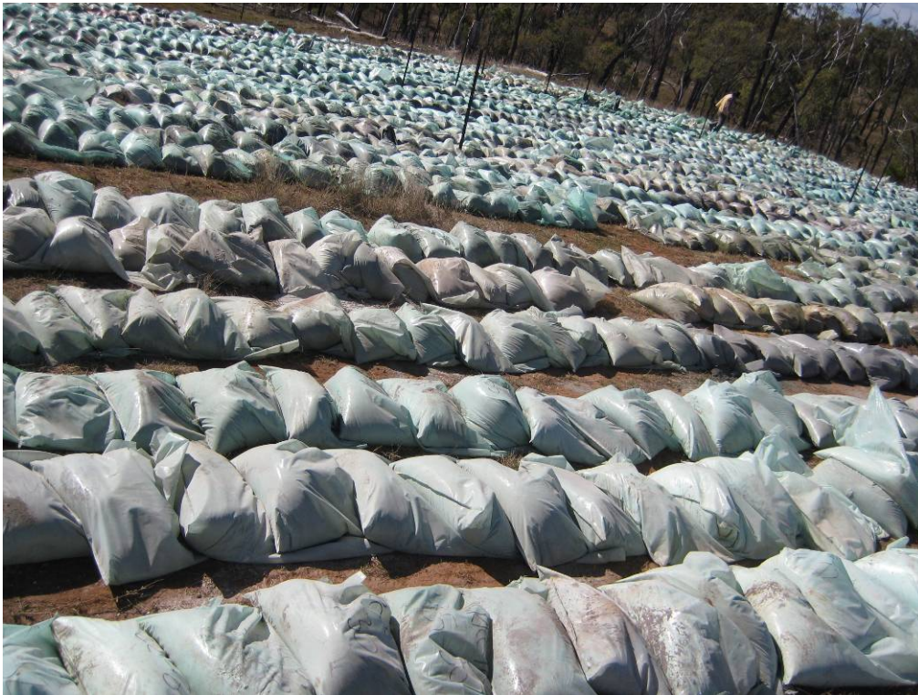
Kroombit 'sample farm', Sept 2008